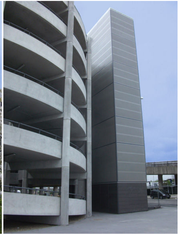
Shaldon 4/8 perforated metal installed as stair tower cladding at Gatwick Airport.