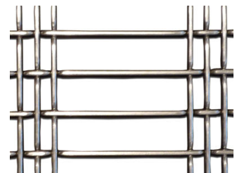
Material: Brocklebank Triple Pre-crimped Mesh